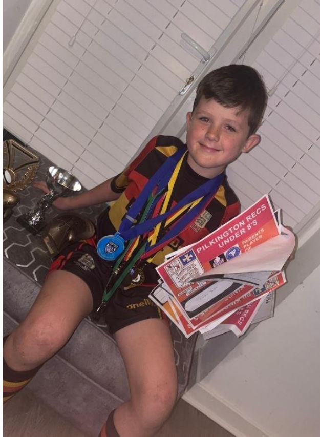
5 - He is getting quite the collection of trophies, medals and certificates