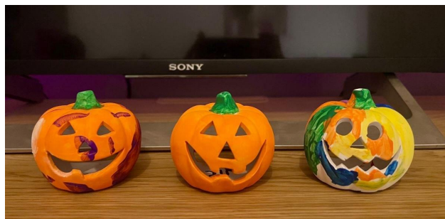
10 - Millie and Eric's crafting creations