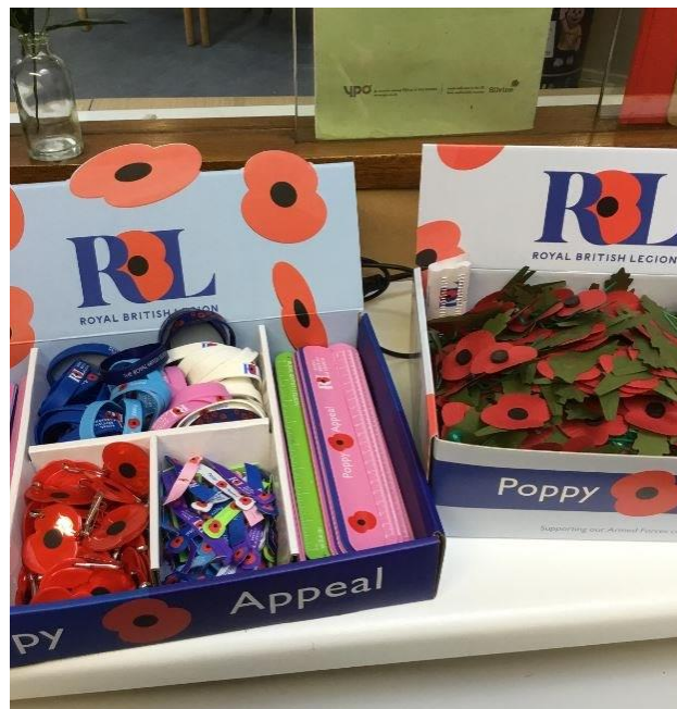
2 - Poppies for sale at the school office

Do you have a spare hour? Helping a child to read is such a rewarding experience. We are always looking for volunteers to come in and listen to our children read. It can be any day for as long as you have spare. We really would appreciate the support and you would be making a huge difference to our children and their reading journey. Please contact the office if you can help!