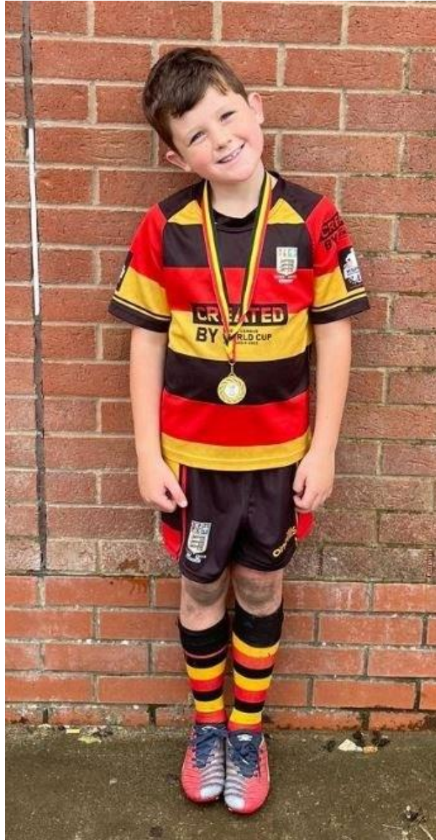
4 - Coaches Player of the Match for Curtis