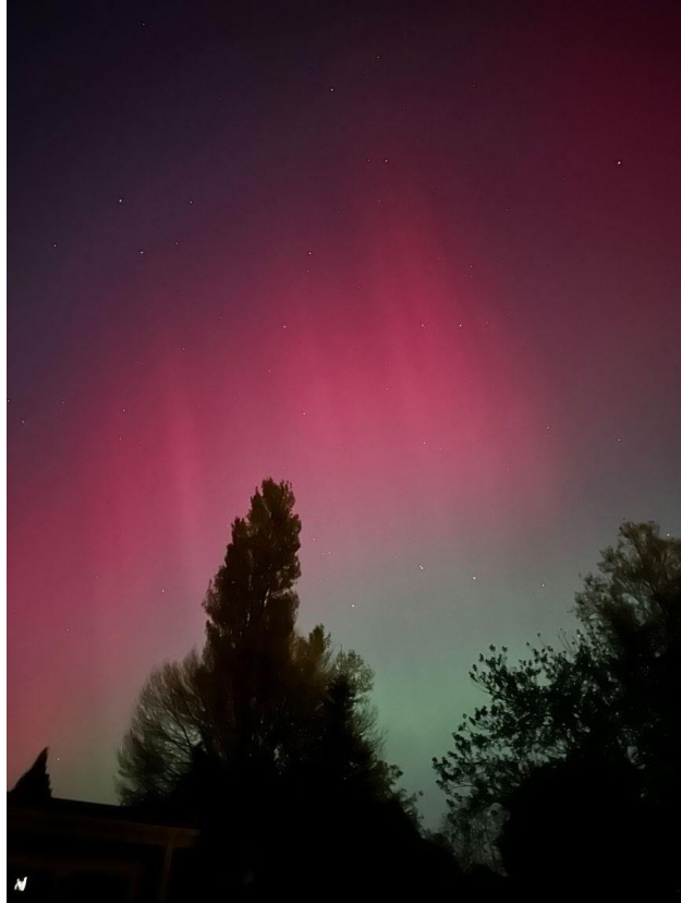
14 - What an incredible photo of the Northern Lights from Florence's back garden