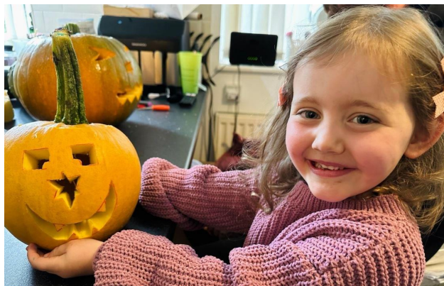
11 - Eveline's carved pumpkin from the weekend when we came home from pumpkin picking