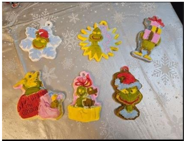
10 - Gwendolyn in Y1 has been very busy making Christmas decorations