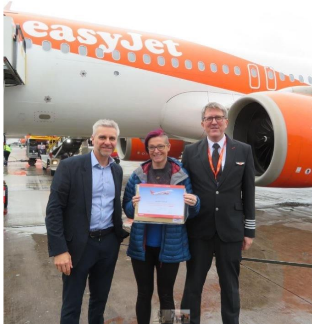
3 - Mrs Leyland conquered her fear of flying after she did a 'fear of flying' course with Easyjet