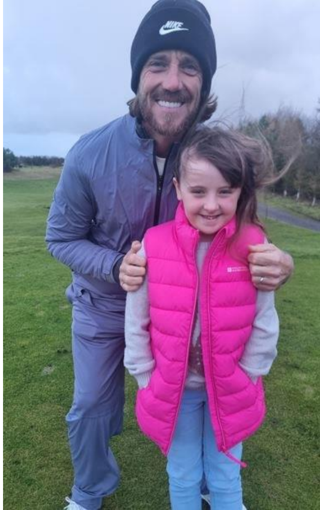
4 - Faith playing golf with Ryder Cup superstar Tommy Fleetwood