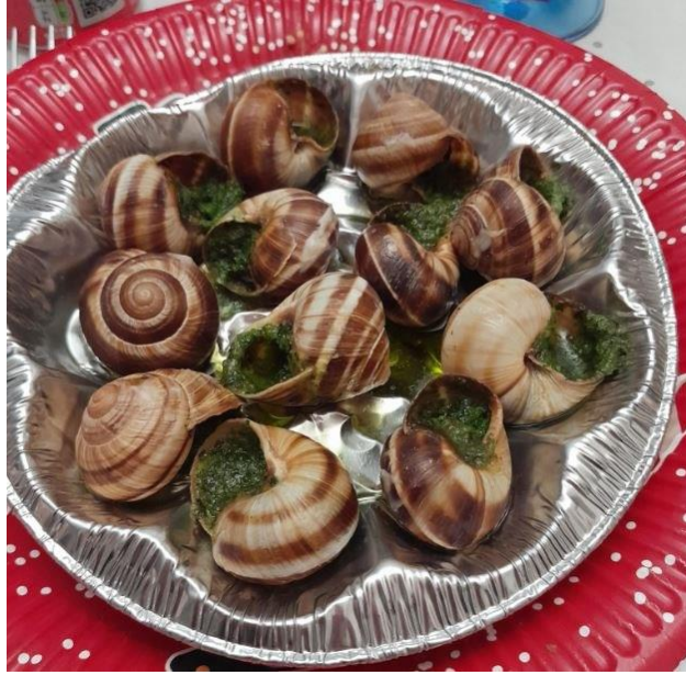
1 - Noel went to visit the new Viking Centre in Rouen and tried escargot... he didn't like them.