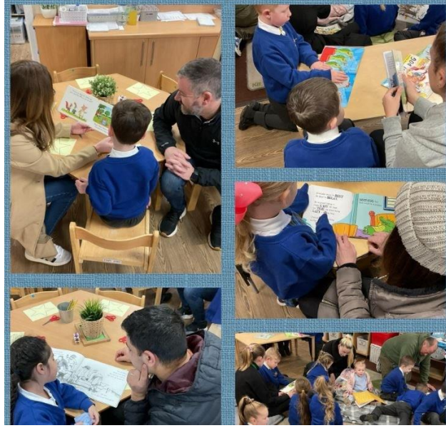
1 - Year One loved having their parents and carers in this week