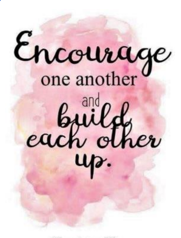
1 Thessalonians 5:11

Our value this half-term is - friendship. 'Encourage each other and build each other up' Thessalonians 5:11