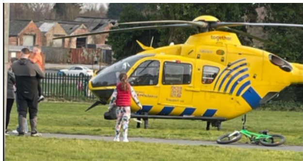
6 - Skylar conquered her fear of helicopters