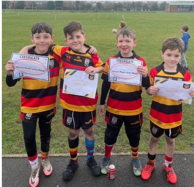
7 - Y4 boys receiving awards at Rugby last week