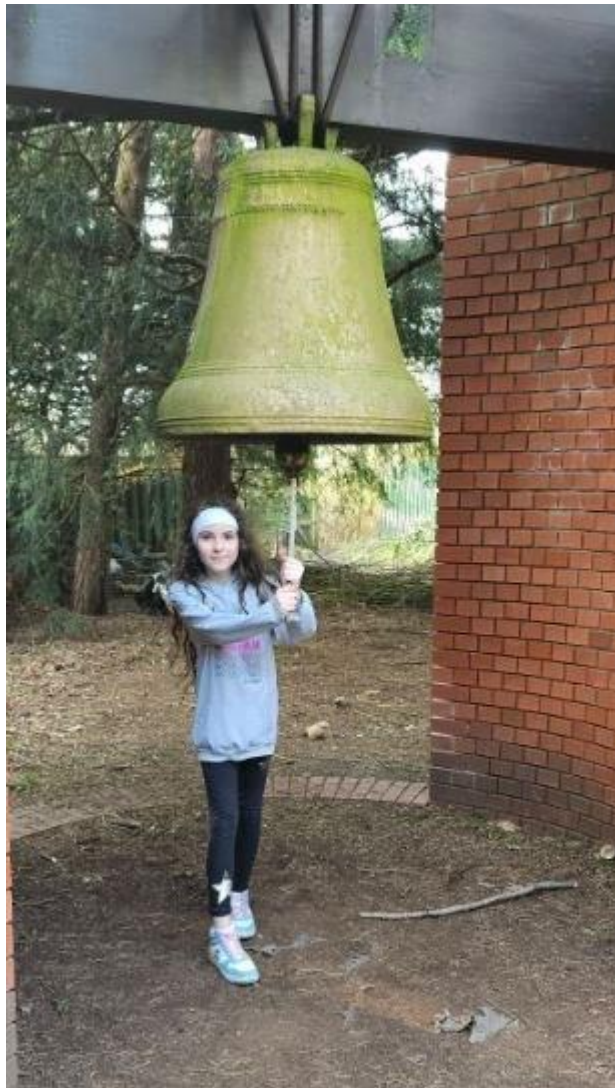
10 - Gloria and Oliver's trip to Apple Cast farm and Norton Priory Museum & Gardens.